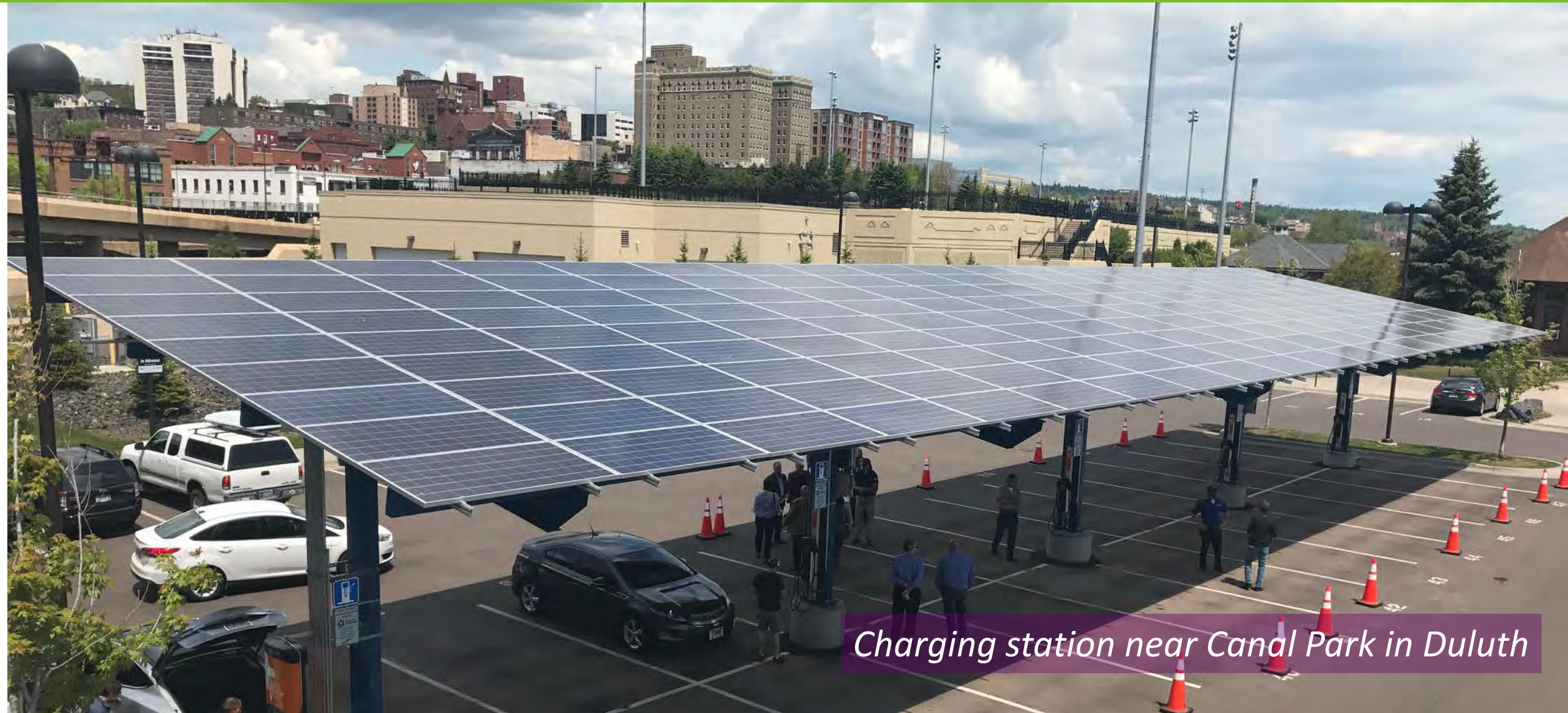
Charging station near Canal Park in Duluth